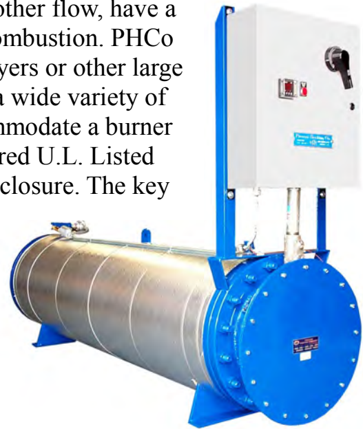
PHCo FPH Model Preheater

PHCo's "Lo-Density" ® electric preheater is the solution if you are looking to save dollars when using the heavier or reclaimed fuel oils. PHCo has developed, through years of research, a system to increase atomization, insure smoother flow, have a more accurate control of temperature and improve combustion. PHCo preheaters are perfect for steam boilers, aggregate dryers or other large burner operations. PHCo preheaters are available in a wide variety of sizes to pinpoint the exact requirements and to accommodate a burner in any climate. All PHCo preheaters include a prewired U.L. Listed Industrial Control Panel housed in a weatherproof enclosure. The key Components include main disconnect, contactors, individual load fusing, control circuit transformer with fusing, indicating solid state temperature controller, solid state high limit and all the necessary wiring for automatic operation. PHCo's system can be powered by any industrial voltage to efficiently heat at a rate of 5-7 watts per square inch, reducing the possibility of coking the heater tubes.